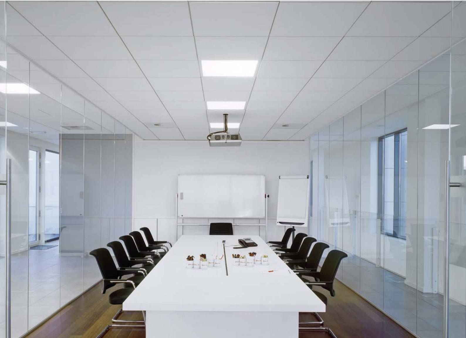
Ultima with Peakform Suprafine XL 15mm Exposed Tee grid