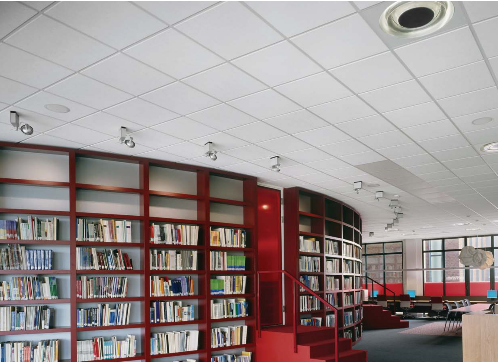
DUNE Second Look I with Peakform Prelude XL 24mm Exposed Tee grid